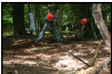
AmeriCorps members received training in sustainable trail techniques in the classroom and in the field