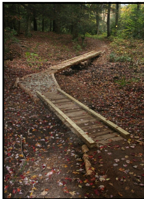
Puncheon, or wooden walkway, constructed on Allegheny Trail in Canaan Valley State Park

September—October 2013: HoH hosted a ten-person Student Conservation Association leader crew. The crew worked on the Allegheny Trail south of the Canaan Loop Road in Canaan Valley State Park constructing 100' of puncheon, 50' of trail tumpike, and 25' of boulder causeway—all sustainable trail construction techniques to raise the trail tread over generally flat, seasonally wet areas. HoH coordinated with Windwood Resort to provide housing; CVSP maintenance staff to provide assistance with trail materials; Tucker County Trails and Canaan Valley NWR to provide hand tools in addition to our new tool cache; and the HoH Project Administrator coordinated the project. These collaborative partnerships are vital in achieving the collective vision of the Heart of the Highlands Trail System.