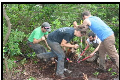
Trail Crew Leader and Volunteers built water diversions, turnpikes and removed stumps